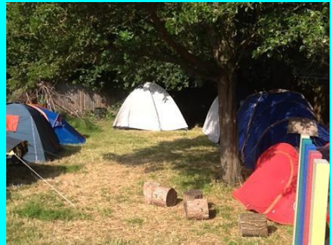
The Forest School area set up for camping.