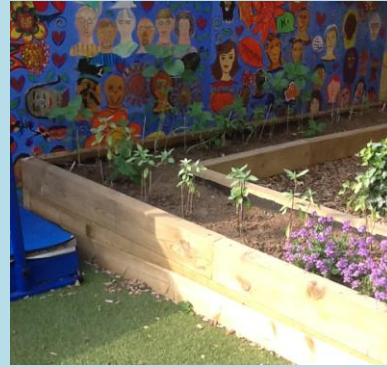
Year 5 & 6 area for growing plants & vegetables.