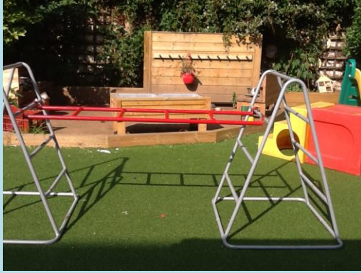
Outdoor Reception area with mud kitchen.