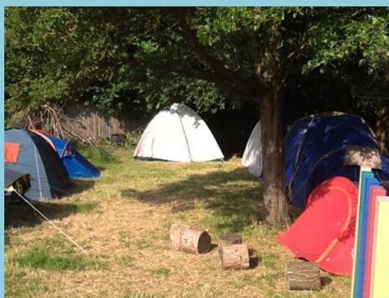
The forest school area set up for year 4 camping.