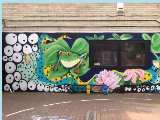
The mural in the outdoor Nursery & Reception area.