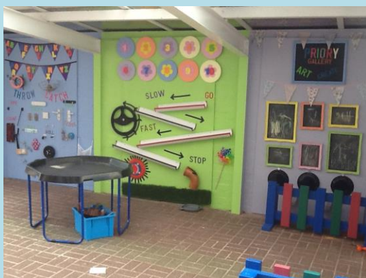
The new interactive learning wall in the Nursery area.

The academic year 2020-21 has been a challenging one for all schools. We are proud that we have still been able to continue improving our provision for the emotional wellbeing and academic achievement of all our pupils. Class timetables have included increased opportunities for physical activities, PSHE and language development. Our newly appointed Recovery Teacher has worked with individuals and groups to develop their emotional wellbeing and address gaps in learning. In addition, we have continued to develop the school environment to enable better learning and quality play experiences. In addition, our involvement with the 'Safer Streets' project for the local community has been a great success.